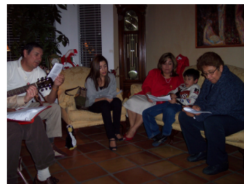
Students and their families enjoy singing Christmas songs

All students of the Missinoary Institute must complete practical work as they study.