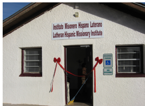
The Lutheran Hispanic Missionary Institute in El Paso, Texas